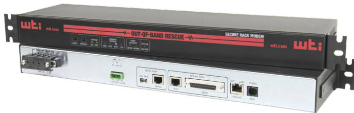
SRM-100DC (-48VDC) Secure Rack Mount Modem For Out-of-Band Management

In addition to providing a secure, dial-up solution for OOB communication, the SRM-100 also includes a 10/100/1000Base-T Ethernet Port, to allow configuration of modem functions via network and also permit the SRM-100 to serve as a network accessible external modem for users who lack access to an internal modem. Support for reverse/outbound SSH/Telnet allows users to easily establish secure connections with other devices on your network.