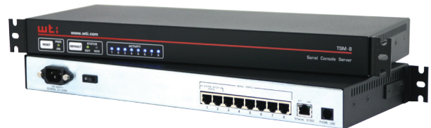
TSM-8 8 RJ45 RS232 Ports

For More Information: Call: (800) 854-7226 Or Visit: www.wti.com