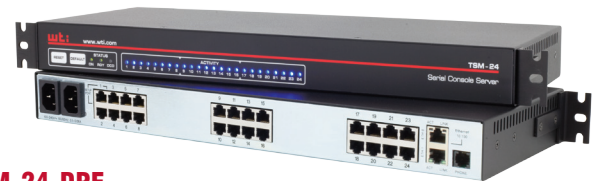
TSM-24-DPE 24 RJ45 RS232 Ports, Dual Power, Dual Ethernet